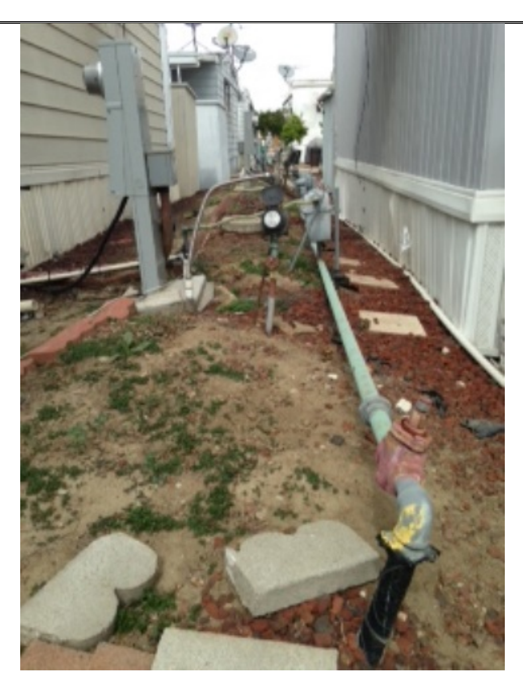
Above is a picture of main gas lines above ground.